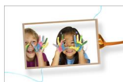
Multi-Input Touch Panels